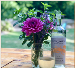
MAY 9 TH Spring Pick-up Party