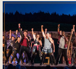
JUNE 27 TH Transcendence Dinner